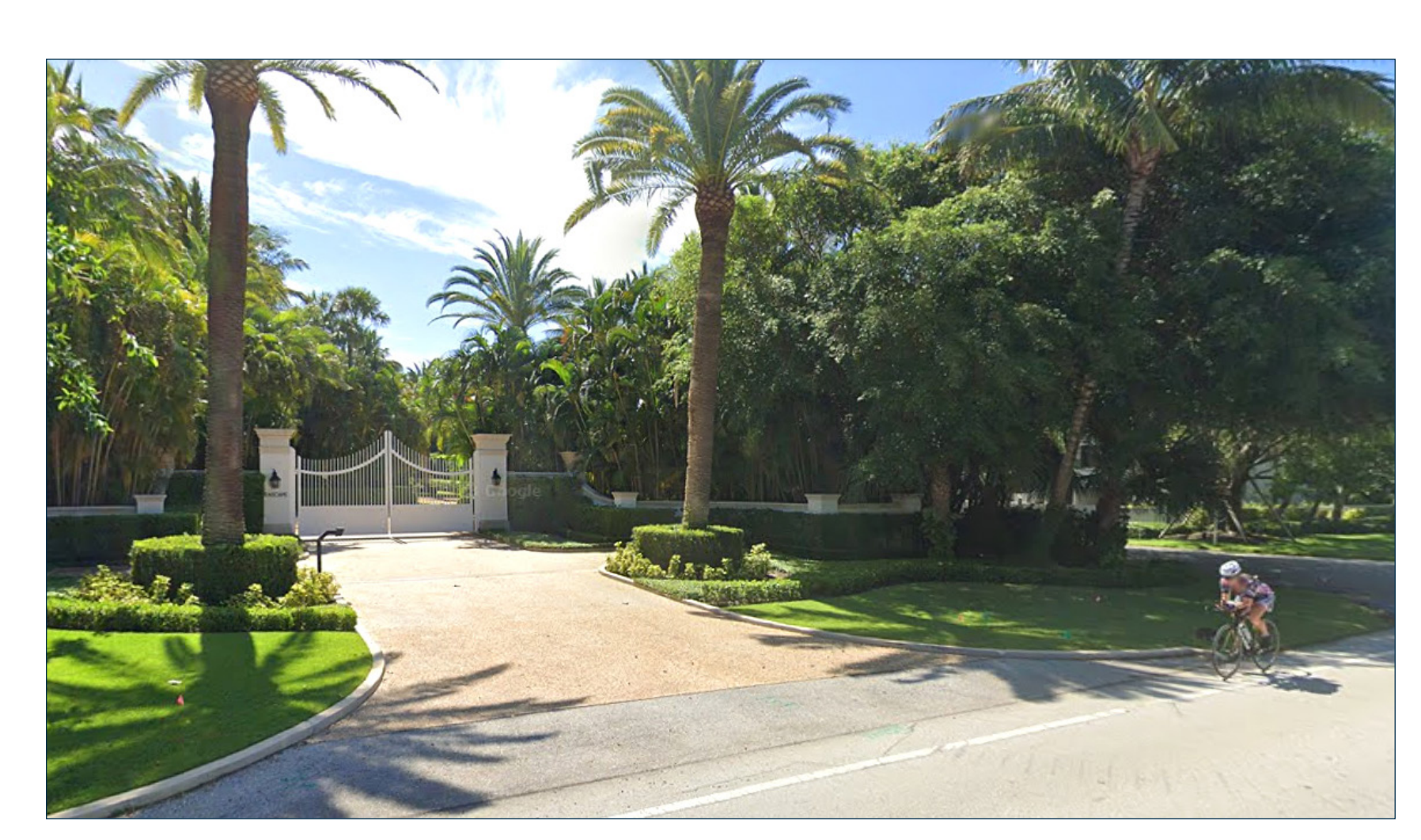
We want this unique part of our island life to be sustained and to thrive.