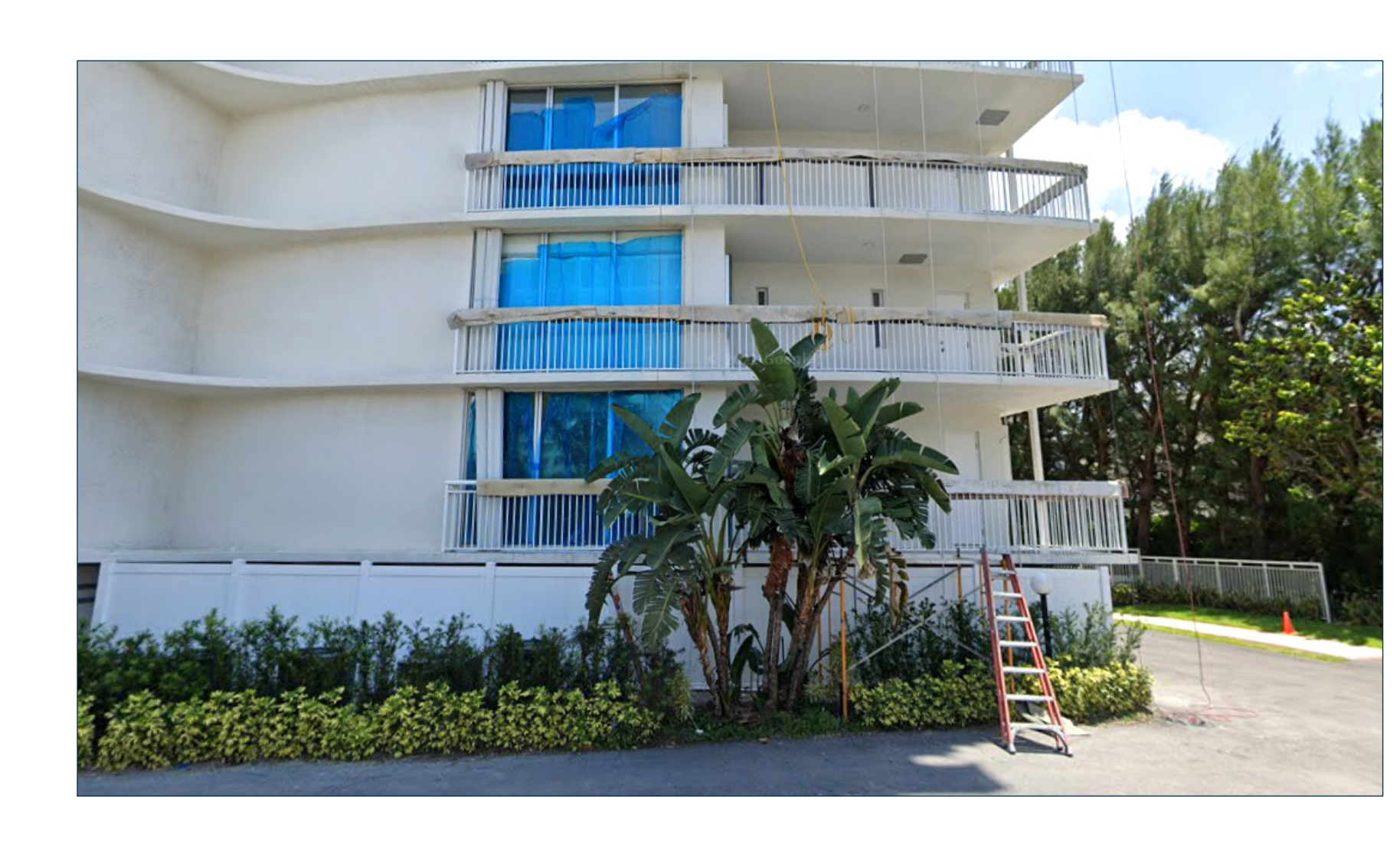
The South End is chock full of aging buildings and infrastructure.