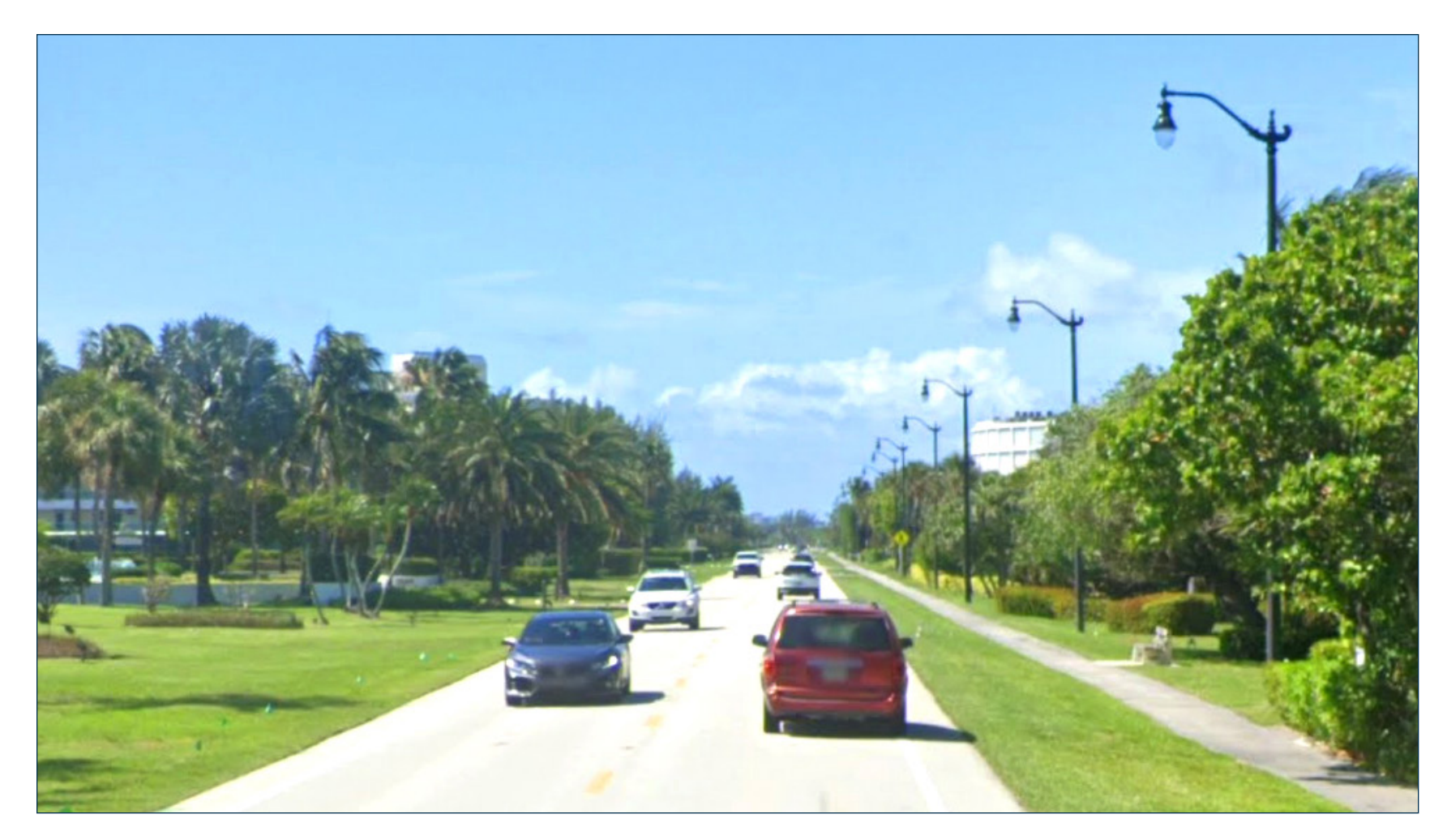
There is too much traffic on our two-lane road.