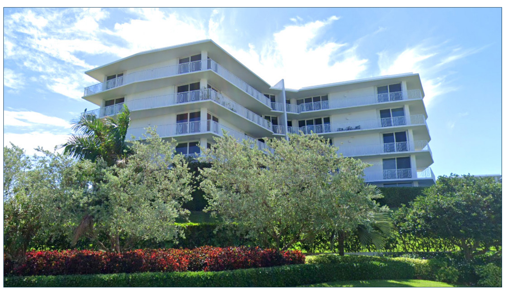
There are serious economic challenges unique to condominiums that disproportionately impact the South End.