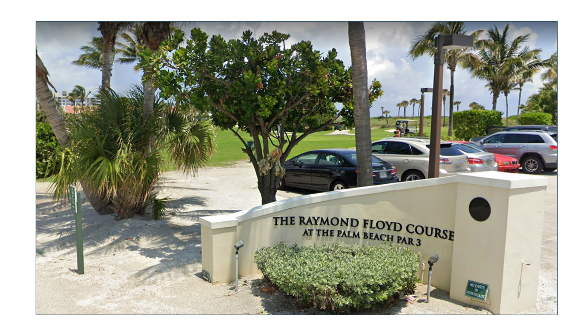
Water from Lake Worth is regularly lapping up onto our golf course. At what point will the South End be its own island?